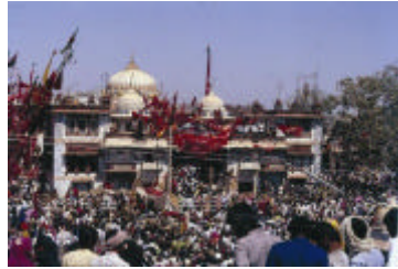
A temple is thronged by thousands of devotees during an annual pilgrimage. This particular one attracts devotees who consider the goddess here propitious for none other than begetting children 01050E11990S01