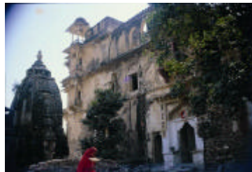
A woman walks into her mansion like home in the Old city of Amber