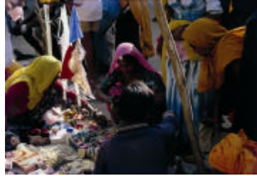
Village women haggle at the bazaar that springs up during the Annual Pushkar Fair at Pushkar 01040DE1990S01