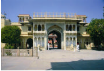
Two turbaned guards at the Gateway of City Palace Museum