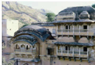
Havelis or mansions like this one abound the old city of Amber. Most of them are in a state of disrepair