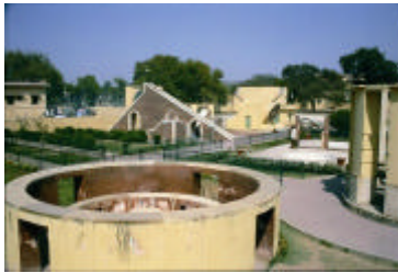
The Royal Observatory or Jantar Mantar at Jaipur adjacent to the City palace