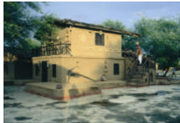
Chokhi Dhani is a hotel and theme park that gives you a taste of the traditional Rajasthan at one place.