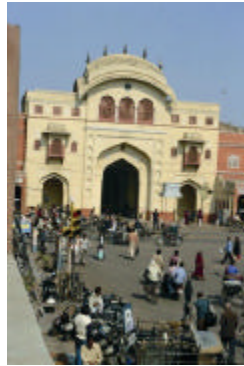
The Tripolia Gate, that leads to the palace complexes behind it. The gate is situated in the midst of Jaipur's old commercial areas.