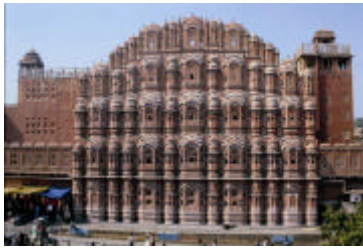
The Hawa Mahal or Palace of the Winds is one of the chief attractions of Jaipur