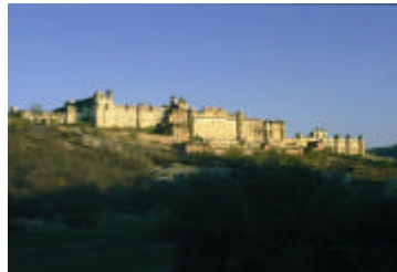
The Amber Fort in the early morning sun