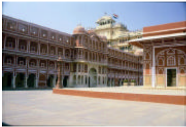
A view of the City Palace, the Jaipur Maharaja's residence from the museum's courtyard