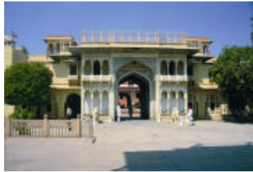
Two turbaned guards at the Gateway of City Palace Museum