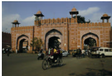
The walled city of Jaipur has several gates to it. This one is called the Ajmeri Gate