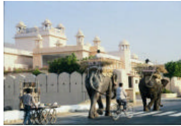
Elephant's pass the Trident hotel on their way to the Amber fort where they will be used to ferry tourists to the fort