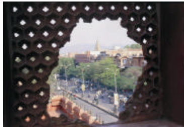
The view of the street beyond couldn't be better framed than this broken Jalli (stone mesh) at Hawa Mahal