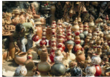
Potter with his ware at Jaipur