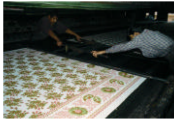
Jaipur is also home to typical textile designs. This is a unit at Sangner where screen has replaced the block printing method