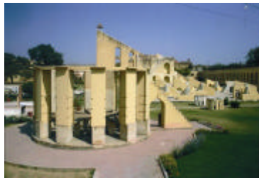
The Royal Observatory or Jantar Mantar at Jaipur adjacent to the City palace